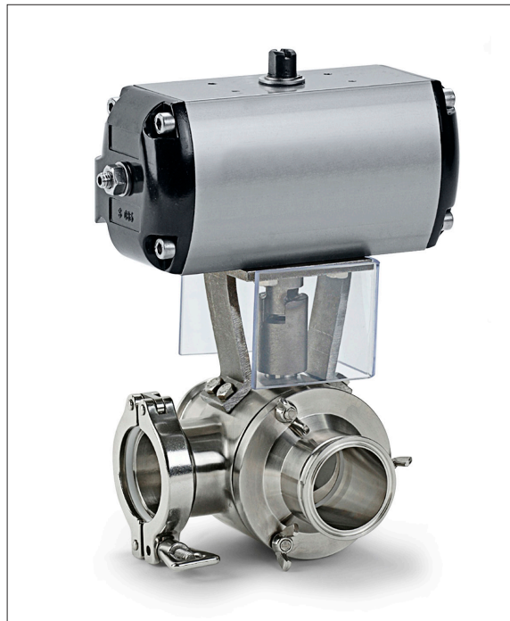
Separating system: Ball valve