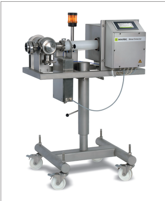
LIQUISCAN PL with height-adjustable stand