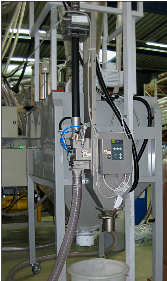
Installation example: Metal separator GF installed in a vertical pipeline (old version)

It detects all magnetic and non-magnetic metal contaminants (steel, stainless steel, aluminium, etc.) – even when they are enclosed in the product. Metal contaminants are ejected via the “Quick-Flap” separation unit.