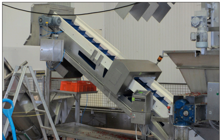
UNICON+ in elevating conveyor version with reject unit, GLS metal detection coil

If you need more detailed information ask for our technical data sheet or a discussion with our experienced Sesotec Sales team.