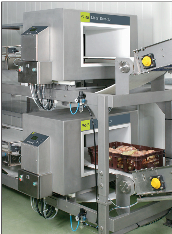
Metal inspection of poultry in E1 containers