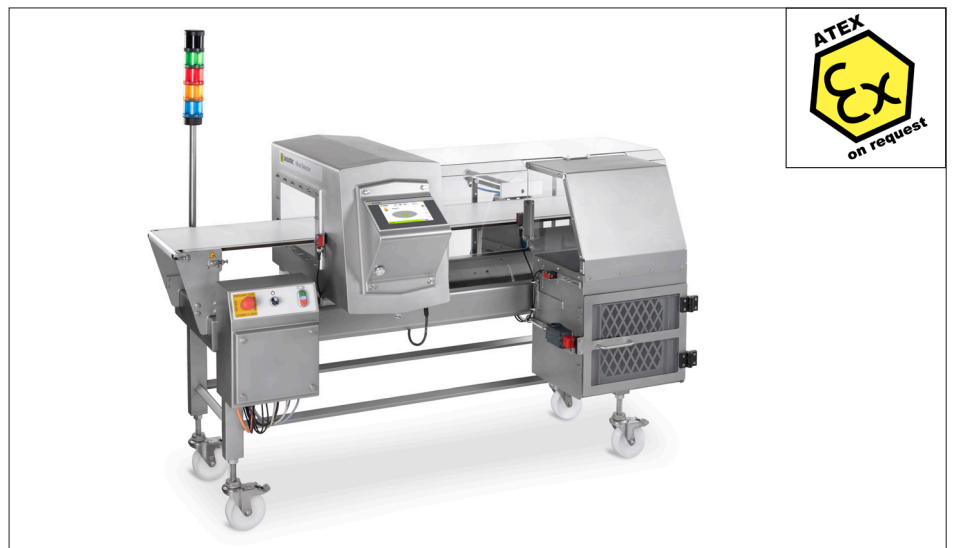
UNICON+ with INTUITY metal detector and Higher Level Security option

UNICON+ metal detection systems detect all ferrous and non-ferrous metals (steel, stainless steel, aluminium etc), even those which may be contained in the product. It is used for inspecting packaged and unpackaged items.